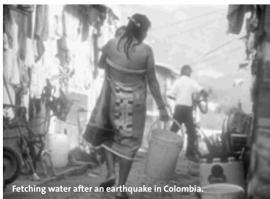
Fetching water after an earthquake in Colombia.

The regional enrollment rate has improved compared to the previous decade—between 88–94 percent of children now attend primary school. 17 Other educational achievements have been scarce and slow. Argentina has an enrolment rate similar to those of developed countries, but dropout rates remain high.